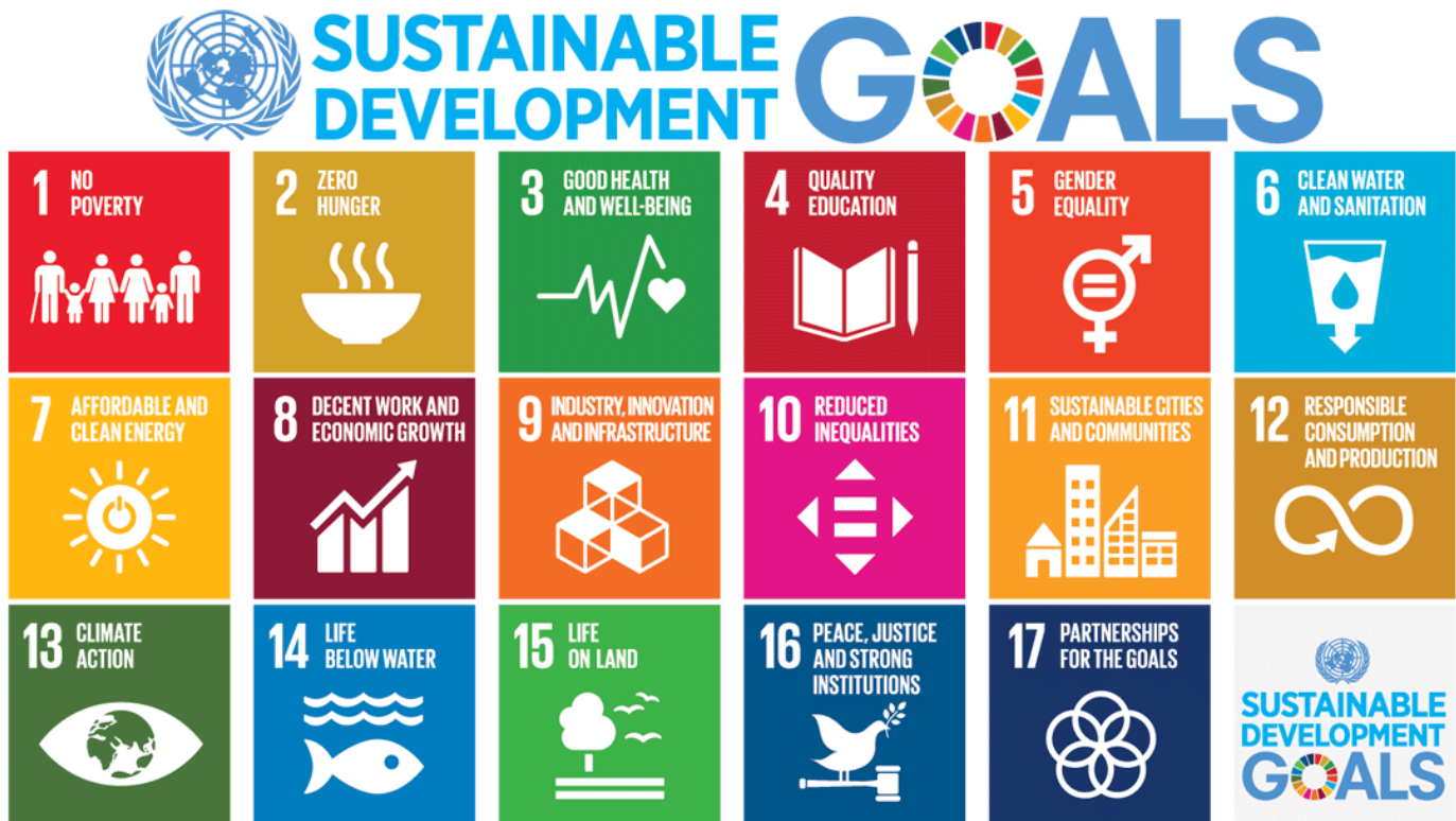
United Nations Sustainable Development Goals (SDGs)

Assess your company's core operations, and select goals based on the SDGs most addressable through your business model.